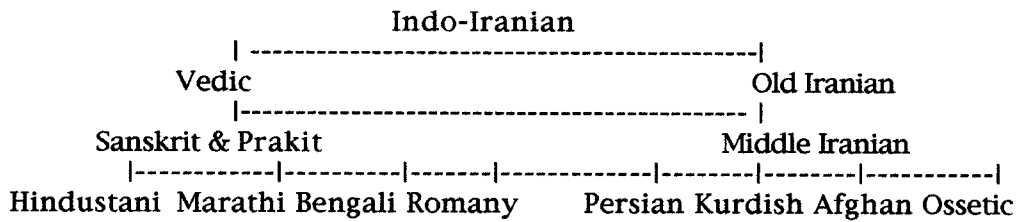
FIG. 1. Hypothetical development of the Indo-Iranian languages.

onto the Indian subcontinent around 1700 B.C. and invokes his “elite dominance model”—the subordination of the local populations by an elite group of charioteers, as described in the Rigveda—to describe it.