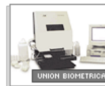
COPAS™ (Complex Object Parametric Analyzer and Sorter) from Union Biometrica

Reliance™, the first true bioinjector from Spark System Solutions BV