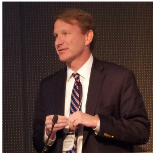
Norman E. Sharpless, National Cancer Institute, USA